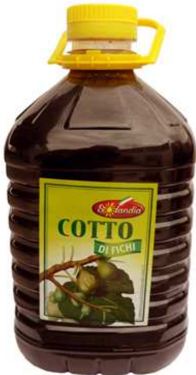
Fig Vincotto, characterized by amber color and sweet taste, is mainly produced in Puglia. It is the result of a long, slow cooking juice of rehydrated fig juice up to reach a candy consistency